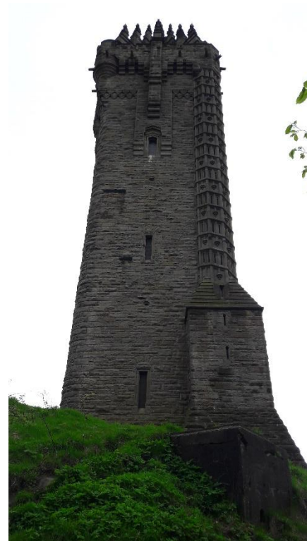
STIRLING : The WALLACE Monument