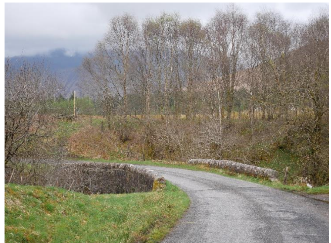
Loch LOMOND area and the river ORCHY