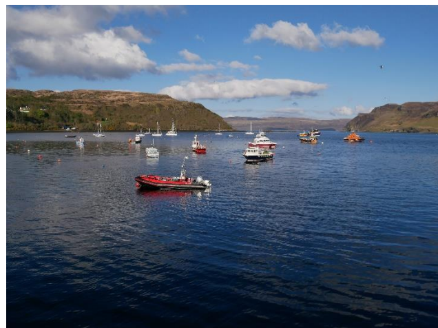
Th Bay of PORTREE