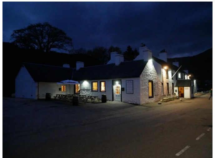
On the way from LOCHALINE to the Inn at ARDGOUR