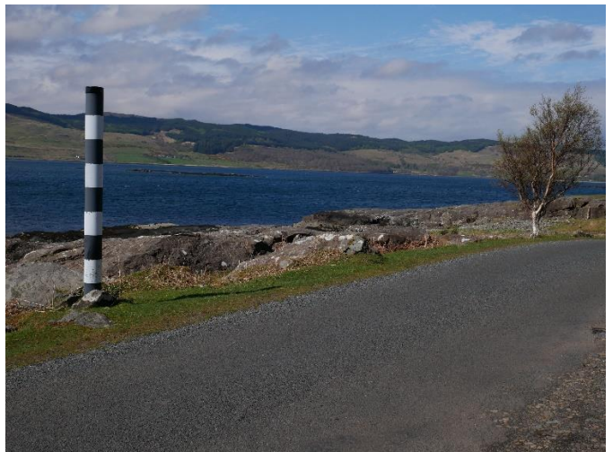
The Isle of MULL : the NORTH, TOBERMORY and the road to BALNAHARD